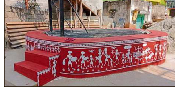
The open well rejuvenated in Bettahalasur.

tion and cleaning, pumping out from the 65 feet-deep well of the water, and installation of every day, to three municipal grilles, pulleys and meters to wards. The council is also laying a pipeline to connect water measure the extraction of water. In Kodagalahatti village, from another rejuvenated well the workers also increased the to an overhead tank, near Vidyheight of a well's parapet wall anagar Cross. The water from a 33 feet-