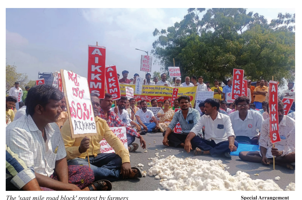
The 'saat mile road block' protest by farmers

Following this protest, another was held on January 4 in the city against the