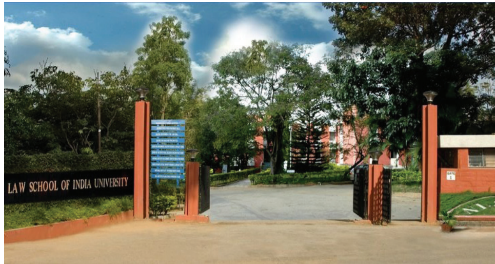
National Law School of India University