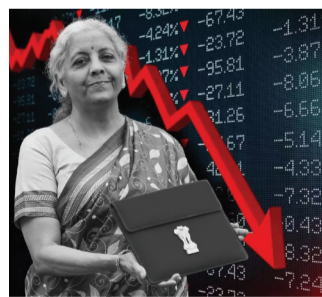
Representational Image Newsx

crashed after Finance Minister Nirmala Sitharaman proposed to increase Securities Transaction Tax (STT). The BSE Sensex dropped 102 points to settle at 80,502, the Bank Nifty index ended 14 points higher at 52,280, and the Nifty 50 index