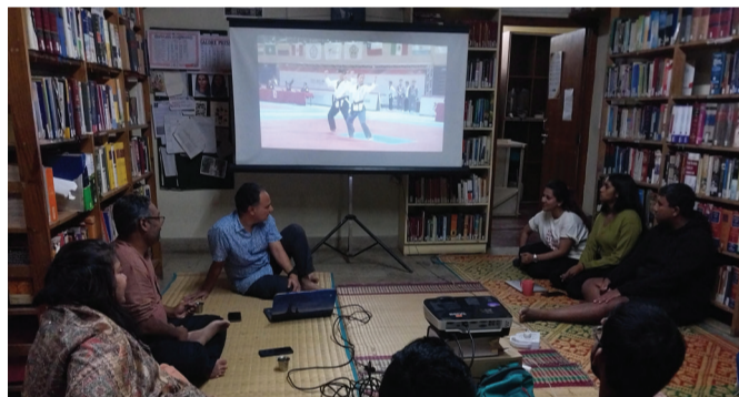
A demonstration on martial art forms

On July 23, the Alternative Law Forum organised a talk titled 'Social Movements & Martial Arts'. It focused on the intent and practice of martial arts with respect to resistance, and shed light upon India's Ayyankali movement, the USA's Black Panther Party, and Europe's Suffrage movement.