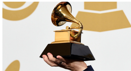
And the Grammy goes to...

After a delay of two months, the 64th Annual Grammy Award ceremony finally took off this time at MGM Grand Garden Arena in Las Vegas. Initially, the ceremony was scheduled for January 31st but was delayed due to the pandemic all over the world. The Grammy Awards honour musical artists, compositions, and albums every year since 1959. The number of categories stood at 86 compared to last year's 84. Jon Batiste emerged as the biggest winner of the evening, with 5 wins out of 11 nominations. Two Indian musicians Ricky Kej and