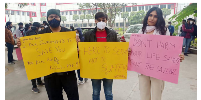
Save the saviors

was brought to the government's attention a few months back, but no serious action has been taken. The final year PG students are idling while the senior batches on the floor are understaffed. This deliberate delay of action by the government cannot be attributed to Covid or to the pending cases in Supreme Court. We will stand with the doctors and are committed to showing our full support," he said. "Normally, there should be three batches on the floor at any given time; however, due to the delay in NEET-PG 2021 counselling, there