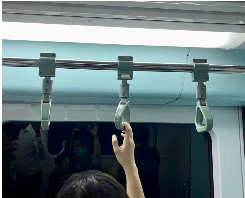
Hanging on by a thread