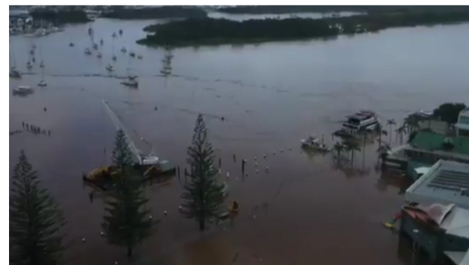
Flooding in Queensland

Local authorities evacuated thousands of residents from