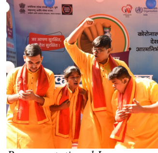
Representational Image

The Ministry of Information & Broadcasting said in a statement that 11,400 strategic locations across 36 districts of Maharashtra and two in Goa have been chosen for the troupes to perform and disseminate information about Covid-19 in regional