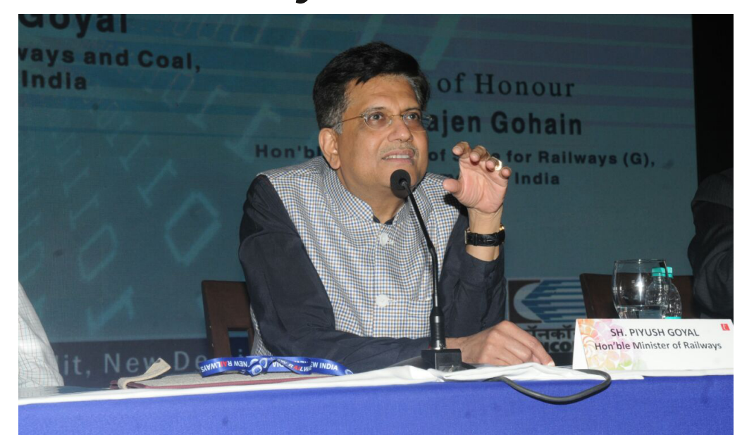
Railway Minister Piyush Goyal

He added, "As of now, with a heavy heart we have started working in the Gujarat