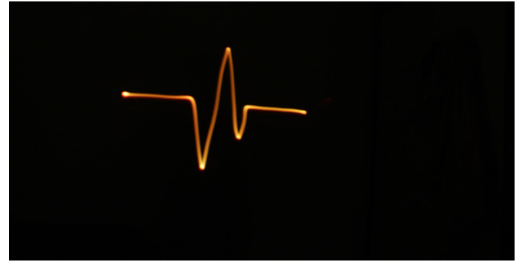
Beating to the rhythm Jesly Pulikotil