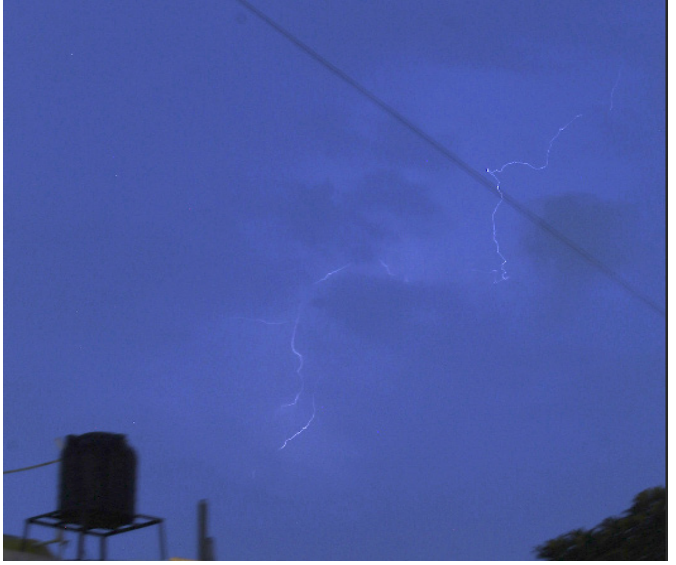
Lightning before the thunder

Sometimes called light drawing or light graffiti, light painting is the photographic technique of using a moving light source like flashlight, glow stick, light brush, etc. to alter an image while taking a long exposure photograph. Instead of just capturing an image as it is, light painters add another element by highlighting an object or creating streaks, colors, or flashes within the image which is seen in this issue.